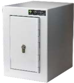
CDC001 (Opt. A)

These external medicine cabinets are available with a selection of three internal controlled drugs cabinets. The three internal cabinet options offer a good choice of storage options, depending on your CD storage needs. These cabinets are below: