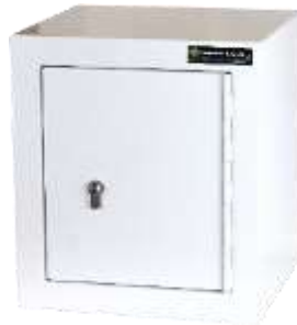
CDC002 (Opt. B)