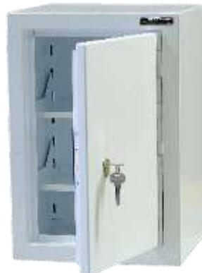
CDC905 (Opt. C)