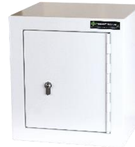
CDC002 (Opt. B)