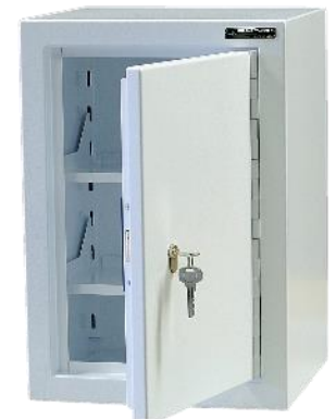
CDC905 (Opt. C)