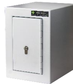
CDC001 (Opt. A)